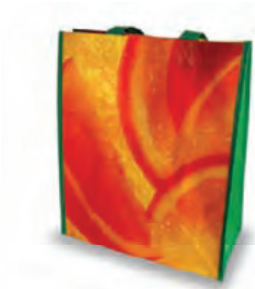
Cangnan Color (profile page 30) Model: Color-PN1 MOQ: 10,000 pieces Description: Shopping bag; nonwoven PP; 34x42.5x10cm; 120g