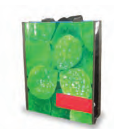
Cangnan Color (profile page 30) Model: Color-PN2 MOQ: 10,000 pieces Description: Shopping bag; nonwoven PP; 31x38x9cm