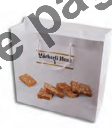
EE (profile page 34) Model: EE-3 MOQ: 1,000 pieces Description: Shopping bag; paper; silk-screened logo; 36x36x13cm; 110g