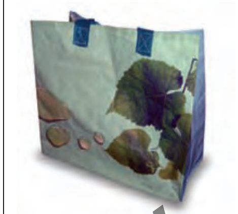
Cangnan Color (profile page 30) Model: Color-PP1 MOQ: 10,000 pieces Description: Tote bag; woven PP; 45x44x22cm; 110g