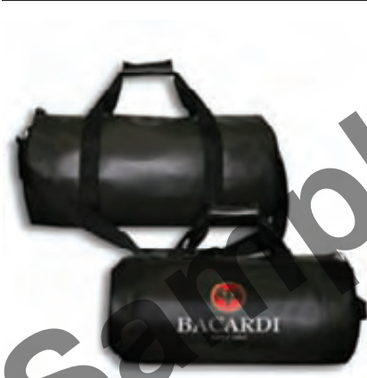
EE (profile page 34) Model: EE-2 MOQ: 1,000 pieces Description: Carrier bag; PU; 190d polyester lining; silk-screened logo; 50x25x25cm; 157g