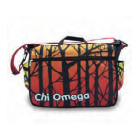
Fujian Henghui (profile page 36) Model: HD-D003 MOQ: 10 pieces Description: Messenger bag; heat transfer-printed logo; 40x35.5x7.5cm; 0.5kg