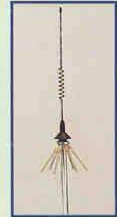
Roof Antenna (3dB gain) for range increase by 30%-50%