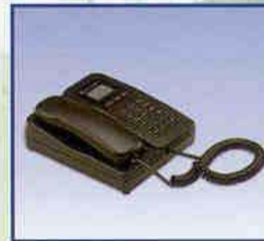
Extra Base unit for line expansion