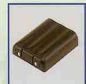
Extra Battery Pack for CL-501 handset

GEORGE TANG INDUSTRIAL CORP. Headquarters: 12th Floor, 1 Chan-Chian, Miaoli City, Taiwan Patented and Approved