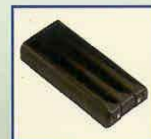
Extra Battery Pack for CL-504 handset

(Communication range depends not only on product quality, but also on local surroundings and antenna location.)