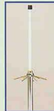
Roof Antenna (6dB gain) for range increase by 50%-100%