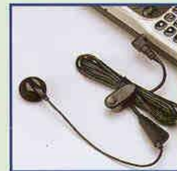
HANDS-FREE KIT for handset