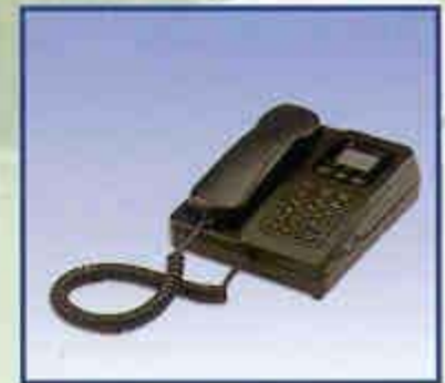
Extra Remote station for voice and data communication