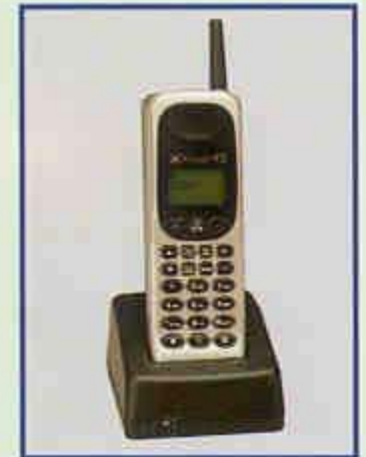
Extra Handy unit For handset expansion