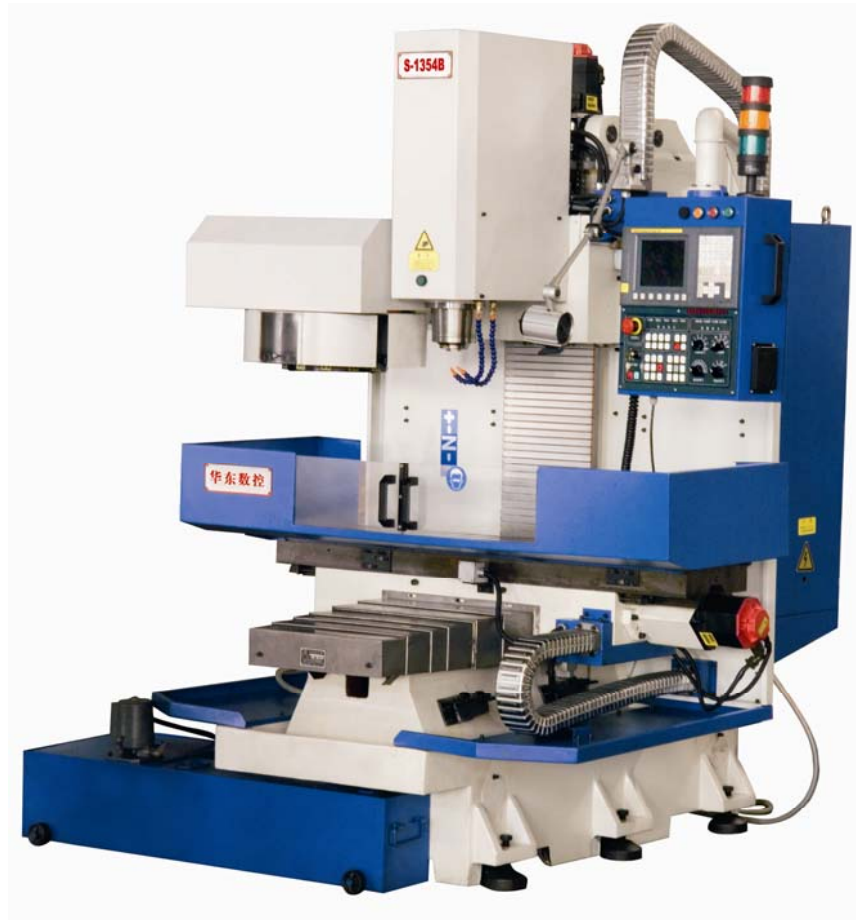
OPTIONAL EQUIPMENT ATC