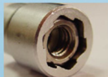
6. Sharp splines grip and hold the damaged item until remove or tight