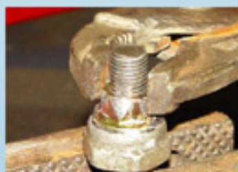
2. Ordinary sockets and wrenches just slip off and strip nuts even more.