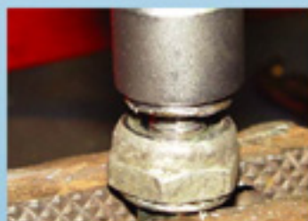
5. Sockets grab and do not let go. Position and tap lightly to establish initial gripping.