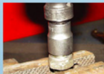
4. Kits are available for us with 3/8" driver hand tool or power tool.