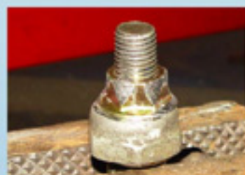
1. Stripped nuts are very difficult and time consuming to remove.