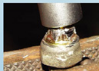
3. Fluted and tapered internal splines are designed to match up with the perimeter of any damaged nut, bolt, etc.