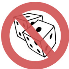
Intercept Gaming Fraud