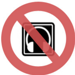
Intercept Bug Detector