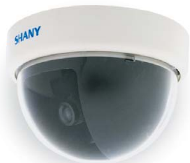
Digital WD 610TVL